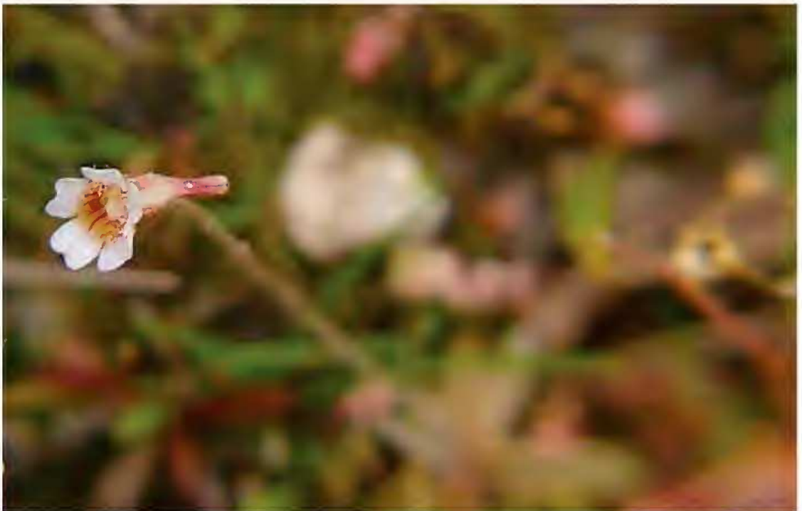
Figure 2: Pinguicula lusitanica growing next to a stand of Drosophyllum lusitanicum near Gaucín, Los Alcornocales Natural Park.